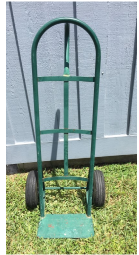
Item Used for Transport