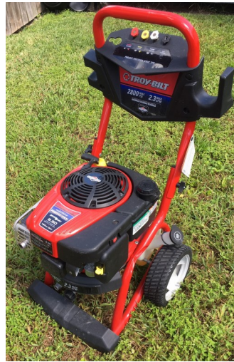
Item that Dispenses Water