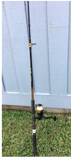
Outdoor Recreation Item